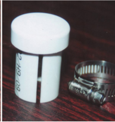
Tail Light Cover 2